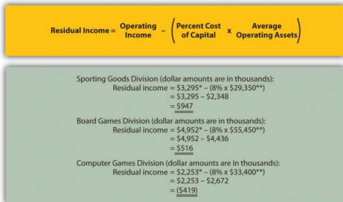
Figure 11.8 RI Calculations (Game Products, Inc.)

*From Figure 11.3 "Segmented Income Statements (Game Products, Inc.)".